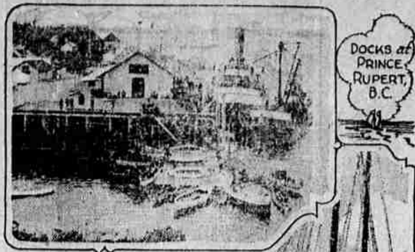
DOCKS at PRINCE RUPERT, B.C.