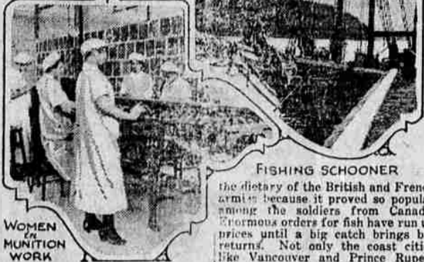
WOMEN in MUNITION WORK

A challenge to the highest paid war workers comes now from the halibut fishermen of the Pacific Coast with a record of $348.60 for eight days' work—$43.57 a day per man.