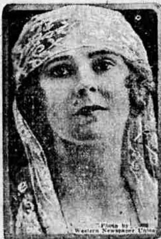
One of England's most beautiful women, Viscountess Curzon, is giving up all her time to look after and care for the wounded soldiers in the London hospitals. This prominent British noblewoman is very popular with invalid troops because of her kindly and helpful acts.