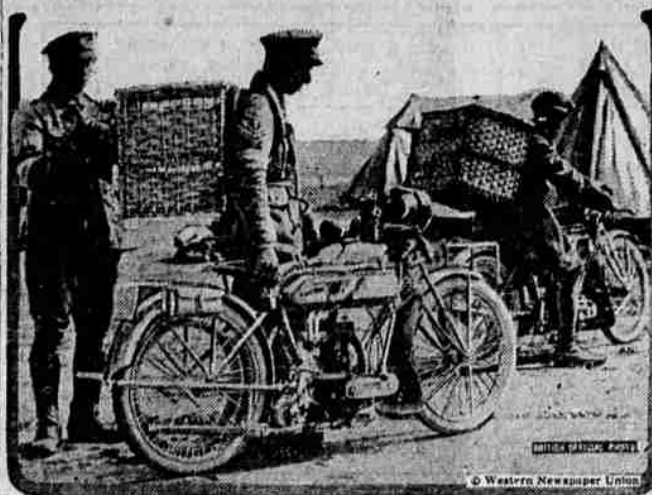
This British official photograph shows how British army homing pigeons are sent up to the fighting lines in France. These intelligent birds have been the means of turning many a possible defeat into a glorious victory. In one of the great battles that raged along the British front recently a British officer found himself surrounded by Boche troops, and released one of his pigeons with a note to his artillery telling them to pour a barrage over the Huns. He was saved.