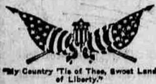
"My Country 'Tis of Thee, Sweet Land of Liberty."

SUBSCRIPTION RATES By Carrier Daily, per month ..... 65c Daily, per three months ..... $1.95 Daily, per six months in advance ..... $3.75 Daily, per year in advance ..... $7.50 Daily, single copy ..... 5c By Mail Daily, per year in advance ..... $5.00 Daily, per six months in advance ..... $2.50 Daily, three months in advance ..... $1.25 Daily, per month ..... 50c The Saturday Evening Observer, by mail, per year in advance ..... $1.50 Weekly Observer-Star, by mail, per year in advance ..... $1.50