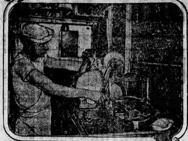
Slicing Bacon on Battleship

ACKIES in the American navy are (in fact) as the best fed body of men in the world. In the ship's galleys every effort is made to eliminate waste.