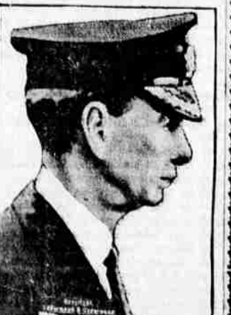
Vice Admiral Sir Roger John Brownlow Keys, who planned the naval raids on Ostend and Zeebrugge.