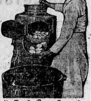
How They Peel Potatoes aboard Ship

Another waste eliminator on the North Dakota is the potato peeler, shown in the lower photo. Nothing is lost except the actual potato skin. There is a sufficient quantity of po-