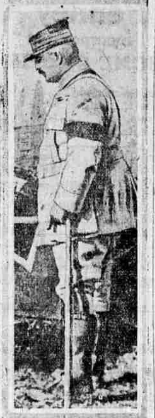
General Desperay has been appointed commander in chief of the Allied forces in the Near East, according to a dispatch from Athens. He succeeds General Guillaumat, who has been made Military Governor of Paris.