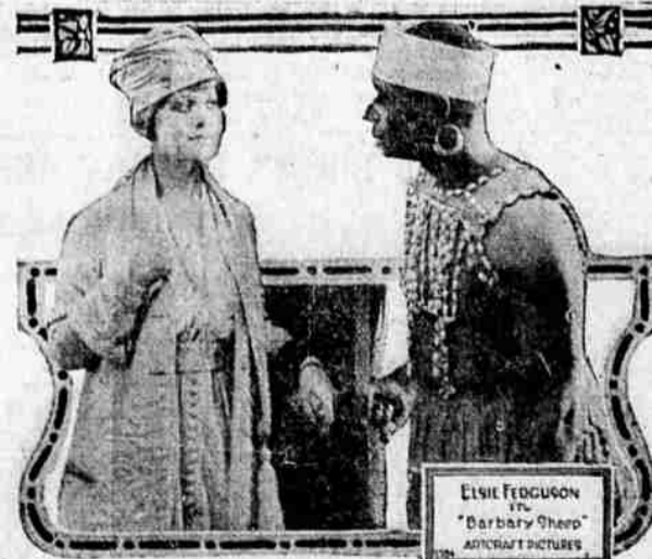
ELSIE FERGUSON in "Barbary Sheep" ARTCRAFT PICTURES

A Picturization of Robert Hichens' Novel.