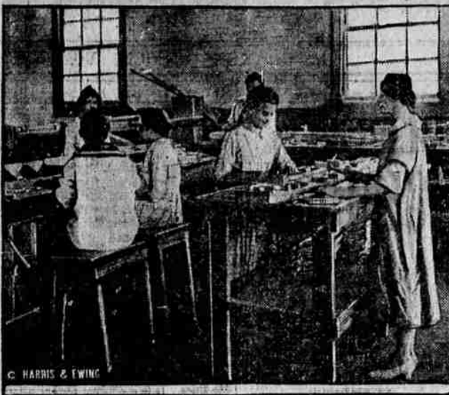
The work of women and girls in airplane factories has proved a boon to the nation's war industry, since the making of planes involves the fitting and assembling of a great many small parts. These girls are helping to build hydroplanes for the navy in a factory near Washington.