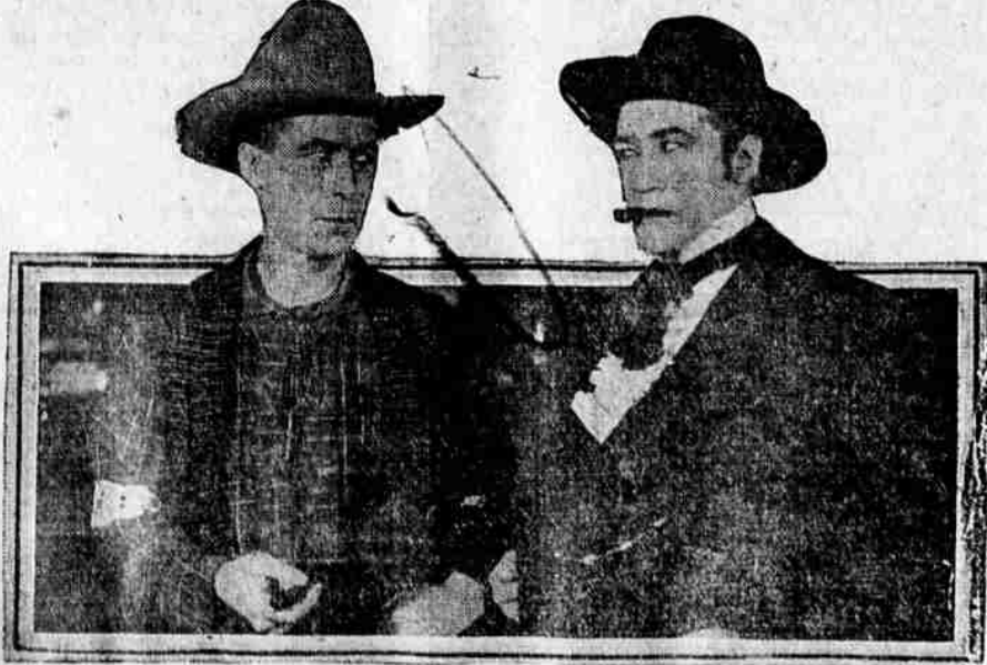
THOMAS H. INCE Presents WILLIAM S. HART in "Selfish Yates" ARTCRAFT