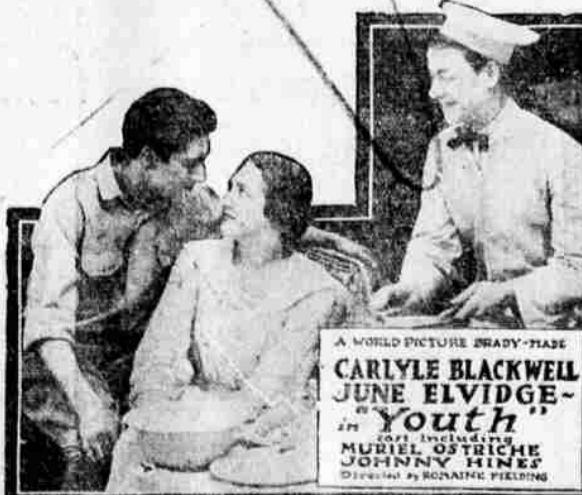
A WORLD PICTURE BRADY-MADE CARLYLE BLACKWELL JUNE ELVIDGE "Youth" MURIEL OSTRICHE JOHNNY HINES Directed by ROYALTY FIELDING