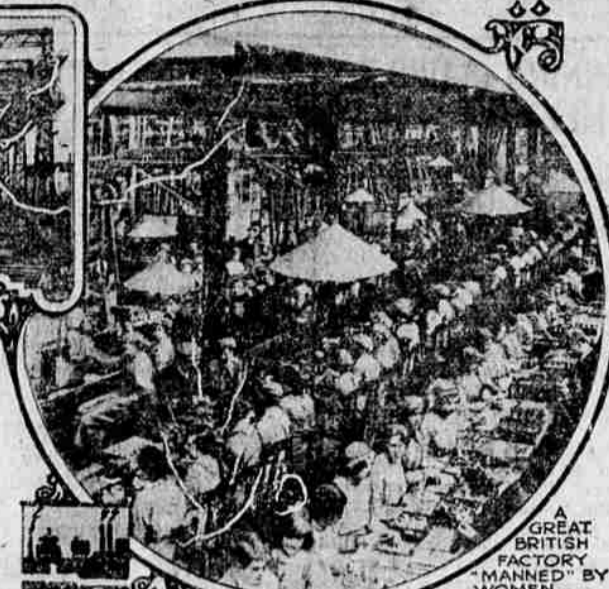
A GREAT BRITISH FACTORY "MAINED" BY WOMEN.

Another important committee is the Dominions Royal Commission, which is inquiring into the natural resources and trade possibilities of the five self-governing dominions. Then there is the Financial Facilities Committee, charged with ascertaining whether the normal arrangements for financing trade will be adequate for post-war needs, and, if not, how they should be supplemented. This Commission will also consider the problem of financing the conversion of munitions plants into factories for normal peace pro-