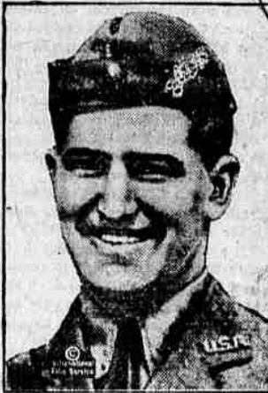
Lieut. Douglas Campbell of California, first American-trained "ace," who was badly wounded in combat.