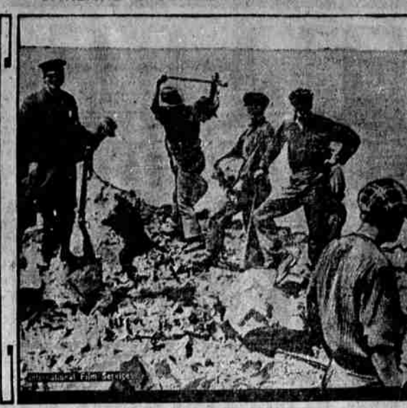
The photograph shows men of Oakland, Cal., who recently drank toast to Wilhelm Hohenzollern. Under the watchful eyes of armed policemen they are "making little ones out of big ones" and thus working off their enthusiasm for the kaiser. The rock-crushing activities will continue for some time to come.