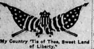
"My Country 'Tis of Thee, Sweet Land of Liberty."

SUBSCRIPTION RATES By Carrier Daily, per month ..... 65c Daily, per three months..... $1.95 Daily, per six months in advance $3.75 Daily, per year in advance..... $7.50 Daily, single copy..... 5c By Mail Daily, per year in advance..... $5.00 Daily, per six months in advance $2.50 Daily, three months in advance..... $1.25 Daily, per month..... 50c The Saturday Evening Observer, by mail, per year in advance..... $1.50 Weekly Observer-Star, by mail, per year in advance..... $1.50