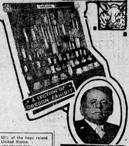
(Above—Sample of Advertisement Used in Eastern Newspapers.)