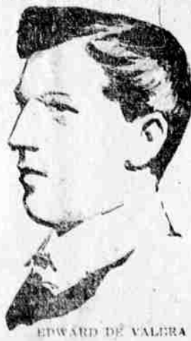
EDWARD DE VALERA

Dr. Valera is the leader of the Sinn Feiners who want practical if not absolute independence from Great Britain.