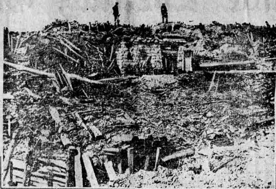
The blood-soaked Messines Ridge, shown above, has just been recaptured by the Boches at a tremendous cost in German dead. It's not a "high hill"—nothing like as high as the hills in rolling middle western United States. But the rest of the Flanders region is flat like a floor, and this ridge thus commands the surrounding country. The ground goes up on a gentle slope and on top, in the center of the ridge, is a crater—the scene of the great mine blast which started the British offensive last June, when General Plumer's men wrested the ridge from the Germans, captured 7000 prisoners and piled up a German casualty list of 30,000. The British had tunneled under the ridge and planted the explosives. In that offensive the British attackers' losses were light. In the present offensive the German losses have been tremendous and the British defenders' losses comparatively light. This picture was taken after the British had wrested the ridge from the Germans. Two British soldiers are doing lookout duty, and making all-out targets of themselves. Just below the soldiers is a German stone dugout, left by Hindenburg. In the left foreground is what is left of a dugout after shelling.