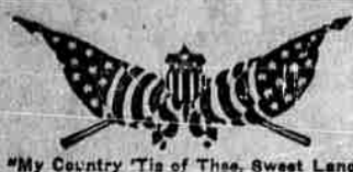
"My Country 'Tis of Thee, Sweet Land of Liberty."

SUBSCRIPTION RATES By Carrier Daily, per month ..... 65c Daily, per three months ..... $1.95 Daily, per six months in advance ..... $3.75 Daily, per year in advance ..... $7.50 Daily, single copy ..... 5c By Mail Daily, per year in advance ..... $5.00 Daily, per six months in advance ..... $2.50 Daily, per three months in advance ..... $1.25 Daily, per month ..... 50c The Saturday Evening Observer, by mail, per year in advance ..... $1.50 Weekly Observer-Star, by mail, per year in advance ..... $1.50