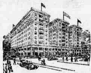
"Five Minutes from Anywhere" in Portland