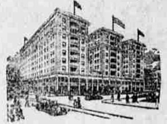
"Five Minutes from Anywhere" in Portland