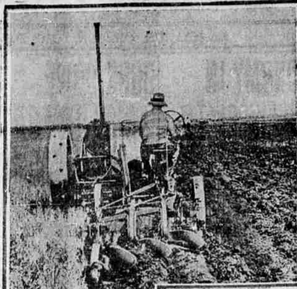
TYPE OF TRACTOR SENT ABROAD BY U.S. FOOD ADMINISTRATION.

American tractors—1500 of them—sent by the U. S. Food Administration, will battle hunger in France. When spring comes they will be in the field. They will help the French to grow 2,000,000 more tons of food.