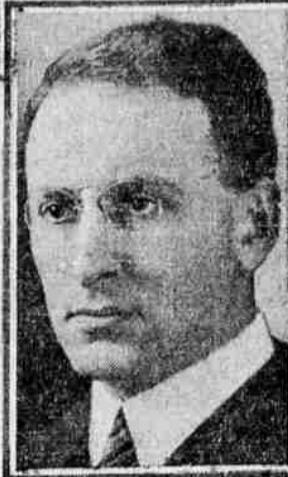
HENRY MORGENTHAU, JR., IN CHARGE OF TRACTOR EXPEDITION.

The tractors will operate mainly in the battle-scarred portion of northern France which has been re-taken from the Germans. These property lines have been largely obliterated. The fields are consequently large and the batteries of tractors will be able to work most effectively. Thus in a few months food crops, especially wheat and potatoes, will be growing in French soil plowed by American tractors—battle lines.