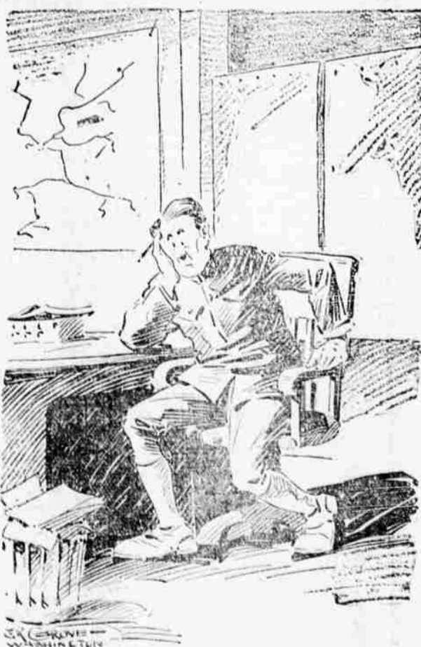
After 120 days away from home on the new government job: "Geo. I wonder if the folks still live in the same old place."