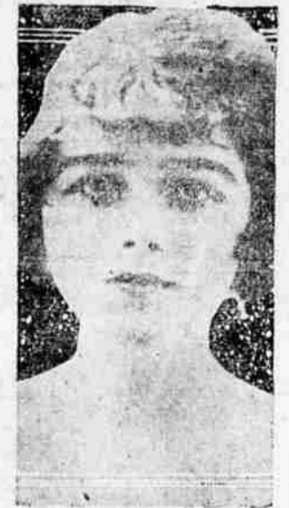
COUNTESS OF WILTON

At a recent bazar held for war charity in London, the booth conducted by Countess of Wilton took in as much money as all the other booths combined. One guess—why?