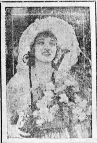
A Vampire Who Wasn't

He thought he was giving up his happiness when he was really finding it.