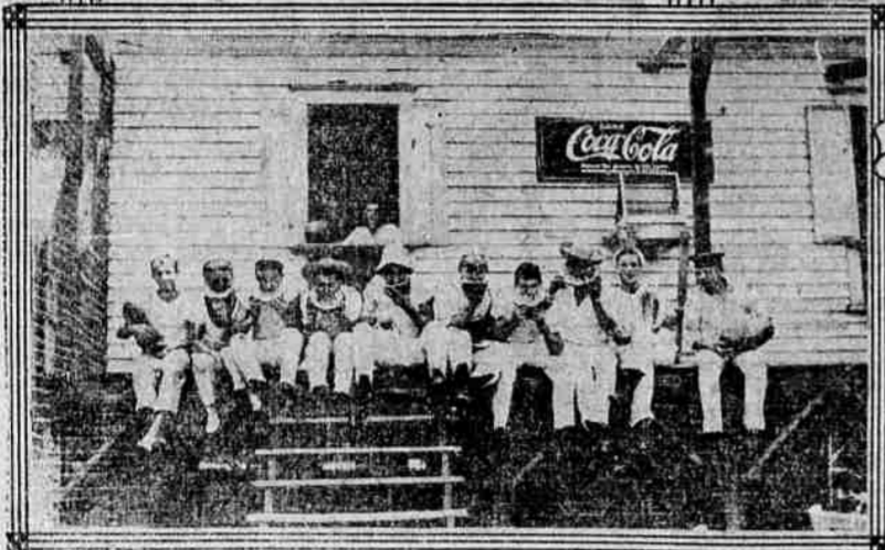
ENJOYING GEORGIA WATERMELON IN FRONT OF THE CANTEEN