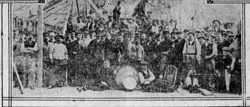
READY FOR A CONCERT

The above pictures give an idea of the treatment that is accorded German prisoners in America. While some of them are given congenial occupation, such as wood carving and similar arts in which the Germans are acknowledged to excel, they are by no means servile to menial tasks, especially when they are given the opportunity to revel in the famous Georgia watermelon.