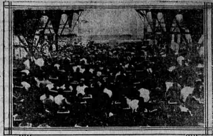
THEATRICALS AT FORT McPHERSON-GA.