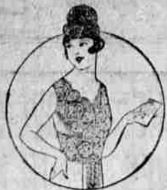
Designed and made with the same care that has made Gossard Corsets world famous.