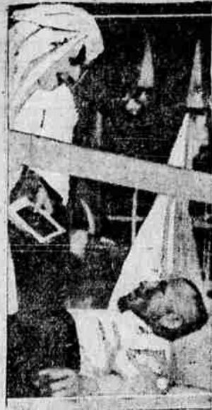
Few wounded Rumanian soldiers there are in the hospitals of that stricken country who have not cheered with Queen Marie. Practically every day she is on a tour of some hospital, going from bed to bed talking to the wounded men and cheering them up. The picture shows her giving a wounded subject an autographed photograph.