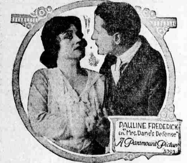
PAULINE FREDERICK in "Mrs. Dane's Defense" A Paramount Picture