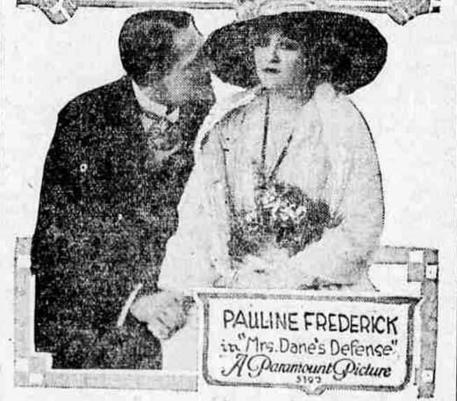
PAULINE FREDERICK in "Mrs. Dane's Defense" A Paramount Picture