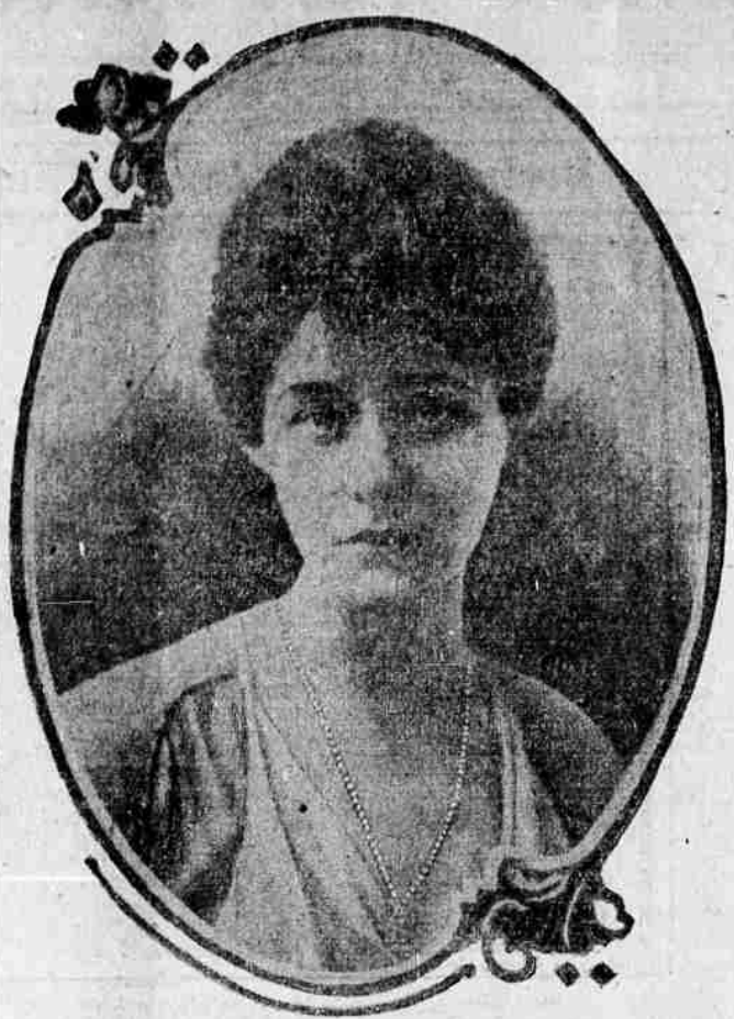
ELSIE FERGUSON, STAR IN ARTCRAFT PICTURES

The most astounding example of unexpected development in the motion picture firmament is Elsie Ferguson. That in itself comes her against the background of other unusual performances in this field. By no means has she been alone in her climb to stardom, both on the stage and on the screen. She, however, gave less evidence of any intention. She just struck