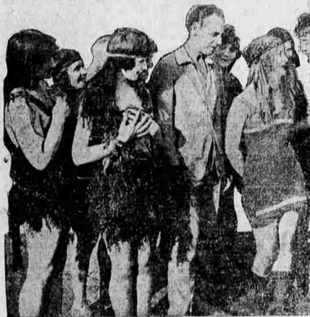
Star Theatre, Sunday and Monday