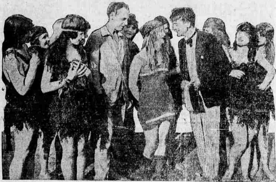
Star Theatre, Sunday and Monday