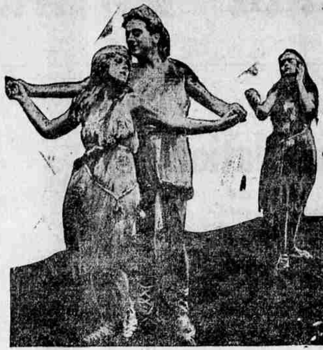
At Star, Sunday and Monday