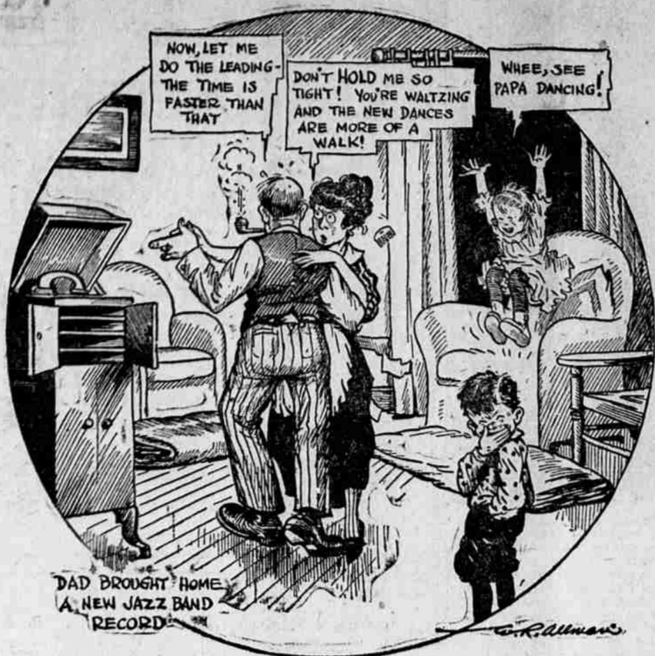
DAD BROUGHT HOME A NEW JAZZ BAND RECORD