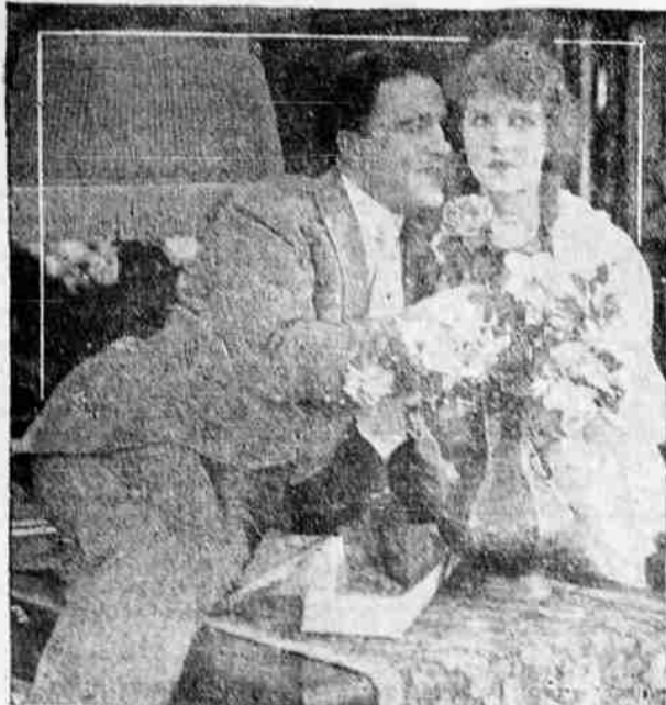
WILLIAM DESMOND IN SCENE FROM TRIANGLE PLAY, 'THE SUDDEN GENTLEMAN.'