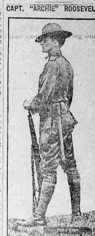
"Archie" Roosevelt, son of Col. Theodore Roosevelt, was recently promoted to captain on the recommendation of General Pershing. He was a second lieutenant.