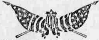
"My Country 'Tis of Thee, Sweet Land of Liberty."

The Observer carrier boys are instructed to put the papers on the porches. if the carrier does not do this, misses you, or neglects getting the paper to you on time, kindly phone The Observer, as this is the only way we can determine whether or not the carriers are following instructions. Phone Main 37 before 7:30 o'clock and a paper will be sent you by special messenger if the carrier has missed you.