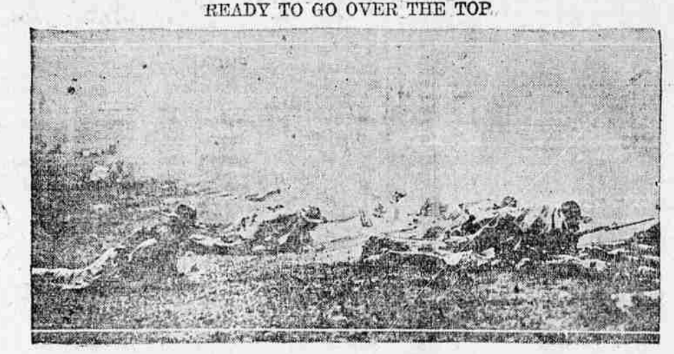
READY TO GO OVER THE TOP. Hugging the earth to take full advantage of the protection offered by the smoke screen preceding attack, these American soldiers are ready to go over the top. They are awaiting only the word of command. The equipment on the backs of these infantrymen shows that they are prepared to hold the enemy trenches for a long time, when they get into them.