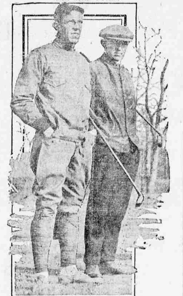
FRANCIS OUMET AND JOHN ANDERSON.