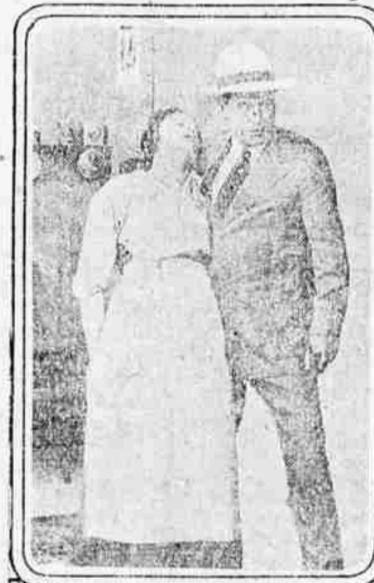
Star, Today and Tomorrow

Telephone Service is Cheapest Service on Earth