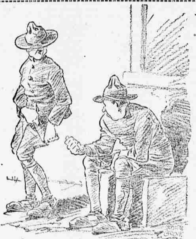
"YOU'D BETTER SEW UP THAT HOLE, STEVE, OR SOMM DAY A BULLET'LL GET YOU, JEST THROUGH YOUR OWN CARELESSNESS."