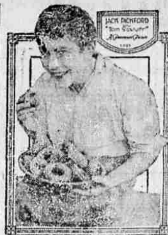
COMING TO THE ARCADE MONDAY AND TUESDAY

remount station. His men are picked riders and horse trainers, and they have worked patiently for weeks to match evenly the mounts for the different organizations as well as exercising special care in selecting only the finest of the horses offered.