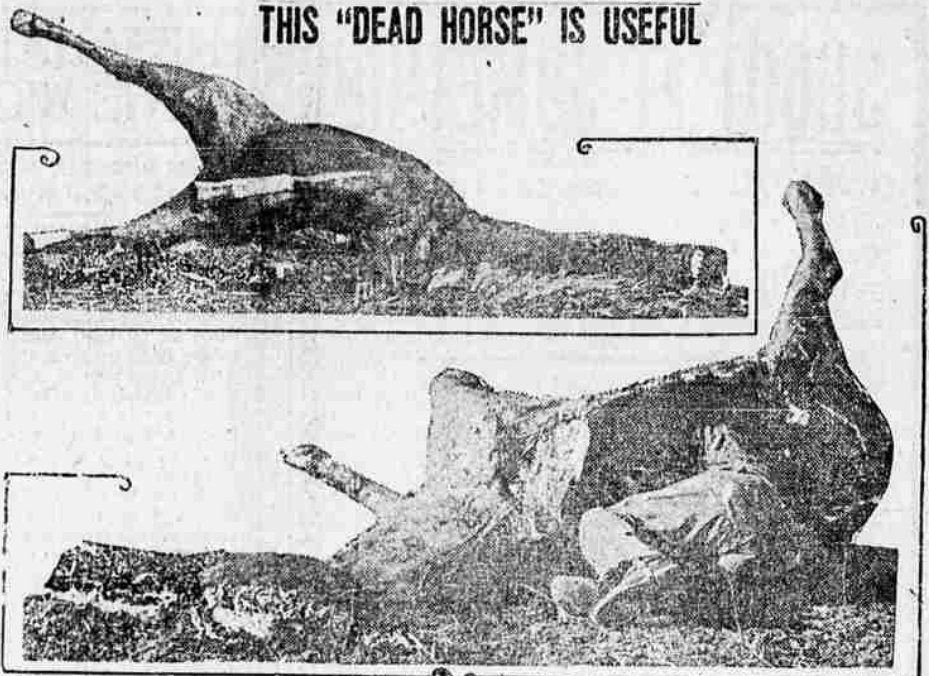
Two views of a "dead horse" that is most useful in war. The top view is how it appears to the enemy. But below it's real purpose as a listening post for American engineers is revealed. Of course, it isn't a horse at all but a fake made by U. S. army camouleurs.

this creek in 1892, recites the Geological Survey Bulletin. A small quantity of gold was taken out of these gravels by means of sluice boxes on the creek near the present site of Pioneer. The deposit afterward explored by the Hope mine was discovered in December, 1894, and in 1895 Phillipsburg was founded just south of the mine. Since that time the Phillipsburg district has produced about $50,000,000 in gold and silver.