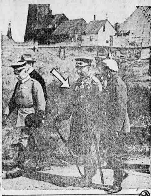
Kaiser Wilhelm with members of his staff visiting the oil wells of Rumania which were destroyed in the Rumanian retreat and have been restored by the Germans. So far as is known this is the first picture of Kaiser Wilhelm to reach America since the British authorities excluded German photographs from the mails. It shows that the kaiser (indicated by the arrow) is rapidly growing older in appearance.