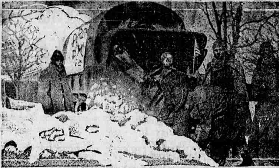
The above truck is one of 30 traveling from "Somewhere in America" to "an Atlantic port" in Uncle Sam's first fleet of war trucks to go overland from factory to tidewater. The driver of the truck and his helpers had a hard tussle with the snow before they got the machine back into the middle of the road. Throughout the trip chains broke and had to be replaced; machinery went wrong and trucks had to be trussed up. Its "cranes" was to demonstrate the possibility of overland shipment to relieve railroad congestion.