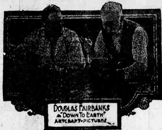
DOUGLAS FAIRBANKS "DOWN TO EARTH" ARTCRAFT-PICTURES