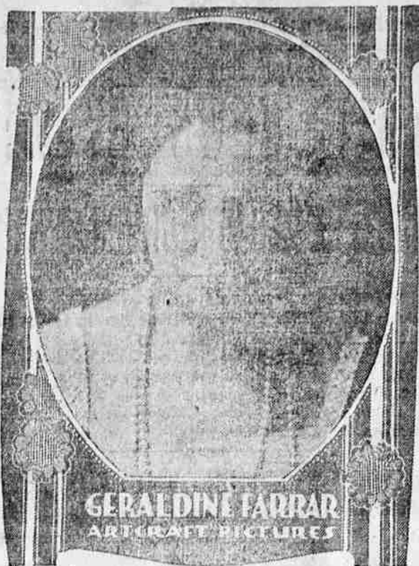
GERALDINE FARRAR ARRIVING FROM LONDON