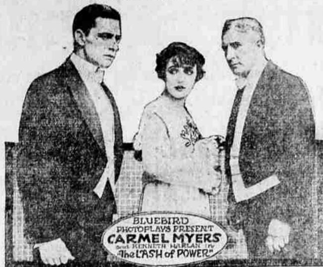
BLUEBIRD PHOTOPLAYS PRESENT CARMEL MYERS best KENNETH HARLAN in "The LASH of POWER"