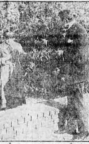
Scene from "Where Are My Children?"