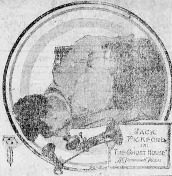
JACK PICKFORD in THE GHOST HOUSE A Paramount Picture