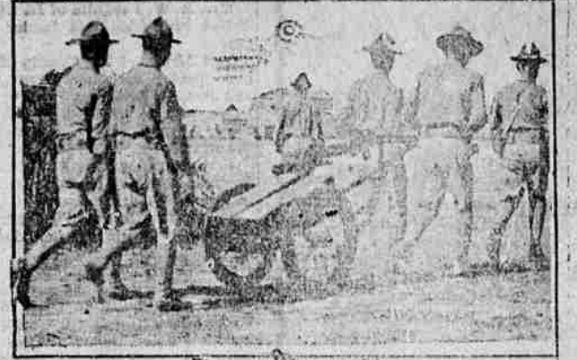
The machine gun is the vanguard of warfare, and in the present conflict has held a decisive role. Rapid transit for machine guns, supremely important, is insured by the new machine gun carriage here shown. It was invented by United States marine officers.