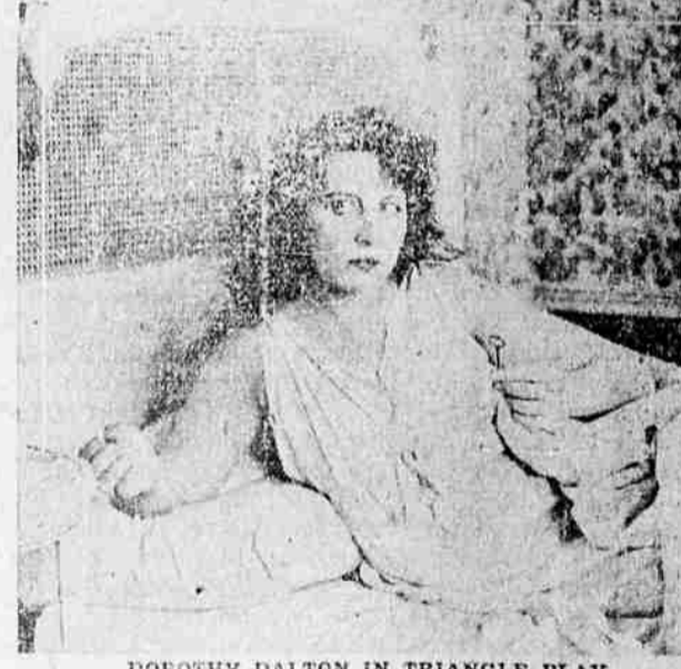
DOROTHY DALTON IN TRIANGLE PLAY, "TEN OF DIAMONDS."