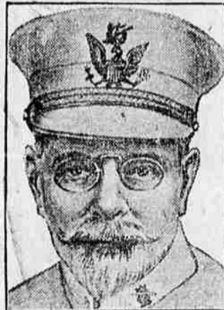
John Philip Sousa, the famous band leader, is a lieutenant in the naval reserve, and is busy building up bands for the American forces.

Phone your Want Ads to the Observer, Main 37.