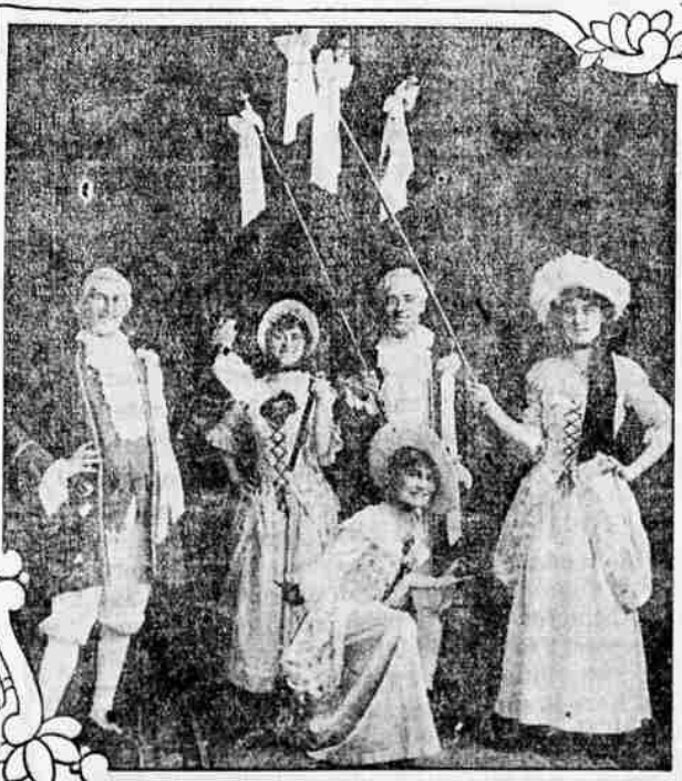
HAMPTON COURT SINGERS.

Season Tickets Five Numbers $1.50, Single Admission 50c