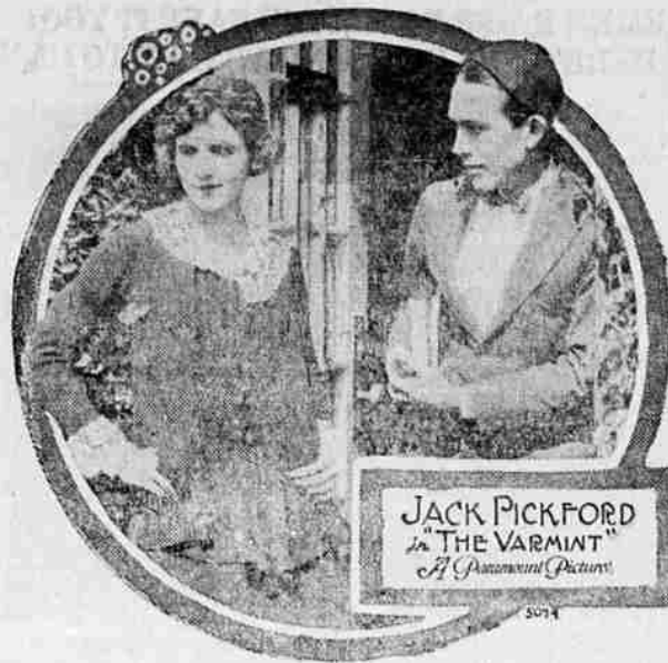
JACK PICKFORD "THE VARMINT" A Paramount Picture