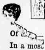
Of In a most